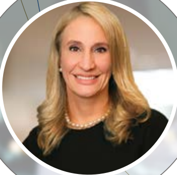
Charles W. Scharf Chairman and Chief Executive Officer

We remain committed to contributing to the safe and consistent functioning of the financial systems and to a sustainable world where people can succeed and economies can thrive.”